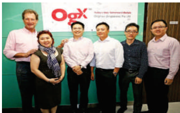
Teams of Originex and Network Box